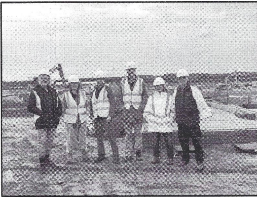
18 Oct 23 – Trustees visit Foundations of 1 st CLT Homes